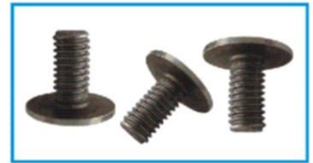
Flat Head Bolt