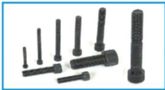
Socket Head Cap Screw