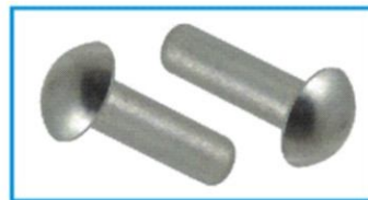
Round Head Rivets