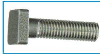
Railway T Bolt