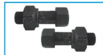
Track Shoe Bolt