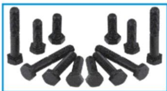
Hex Head Bolt