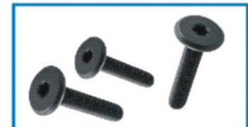
Joint Connector Bolt