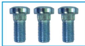
Round Head Knurling Bolt