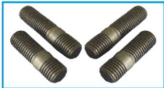
Double Ended Studs