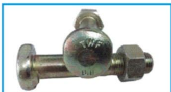
Tractor Rim Bolt