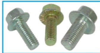
Hex Flange Bolts